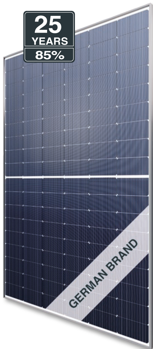
Fig. similar 108MHEN21104A

Exclusive linear AXITEC high performance guarantee!